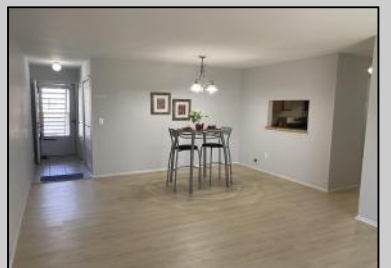
89 Club PI Galloway Township, NJ 08205