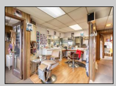
3802 Bayshore Cape May, NJ 08204