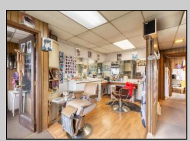
3802 Bayshore Cape May, NJ 08204