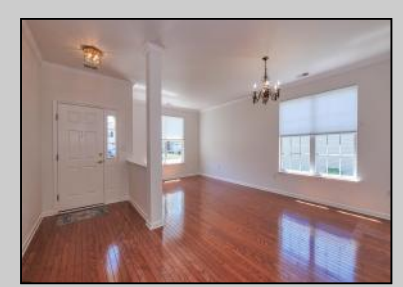
102 Newcastle Galloway Township, NJ 08205