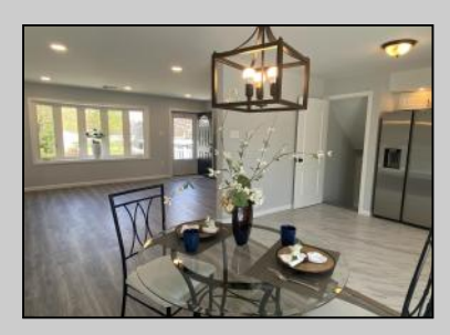
172 EXTON RD Somers Point, NJ 08244