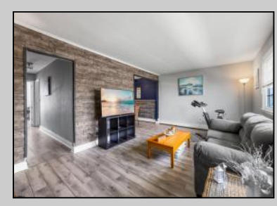
5416 Suffolk Ventnor, NJ 08406