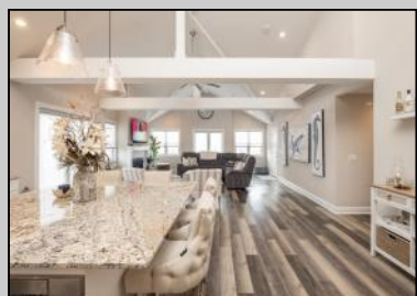
1000 Asbury Ocean City, NJ 08226