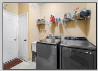
137 St. Georges Galloway Township, NJ 08205