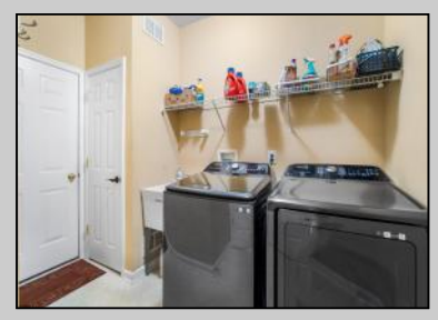
137 St. Georges Galloway Township, NJ 08205