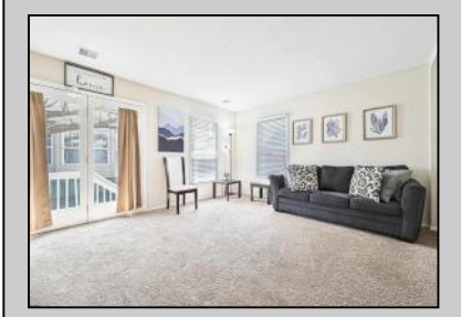
324 Beach Ave Atlantic City, NJ 08401