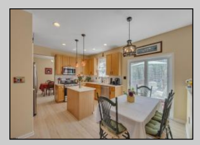
749 Streamview Vineland, NJ 08360