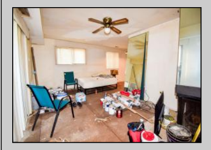
2415 Bayberry Mays Landing, NJ 08330