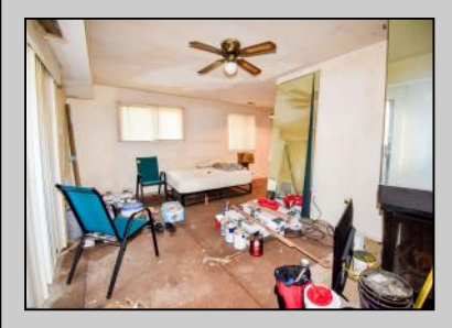
2415 Bayberry Mays Landing, NJ 08330