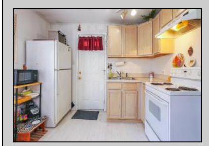
4224 Brigantine Ave Brigantine, NJ 08203