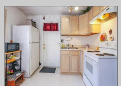
4224 Brigantine Ave Brigantine, NJ 08203