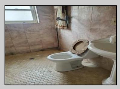
211 Sacramento Ventnor, NJ 08406