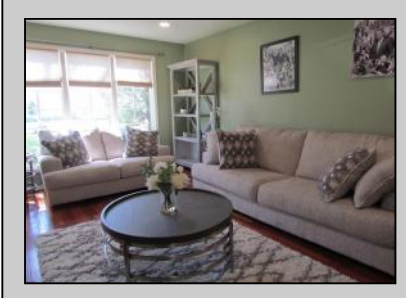
305 Gravel Bend Rd Egg Harbor Township, NJ 08234