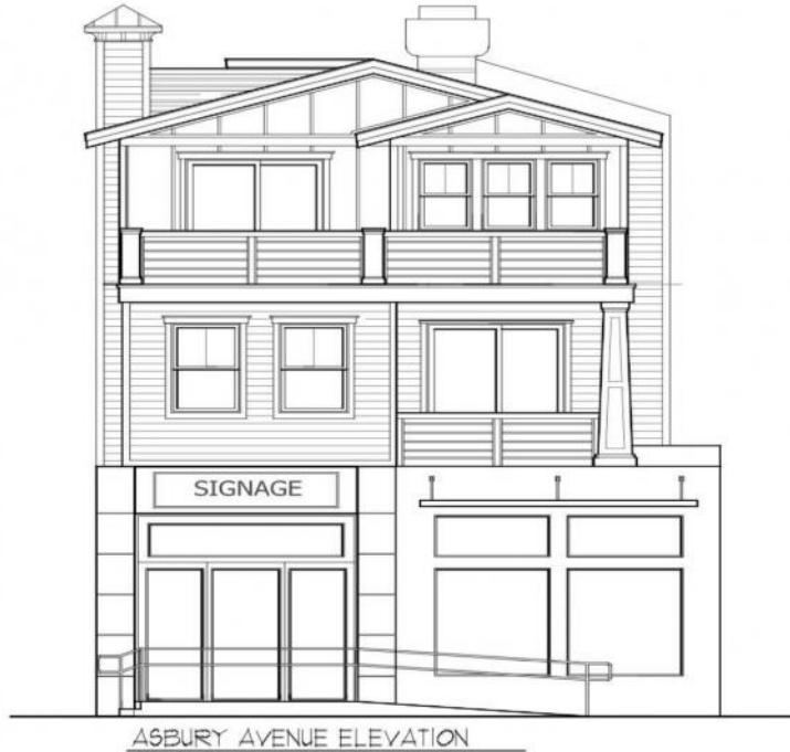
ASBURY AVENUE ELEVATION