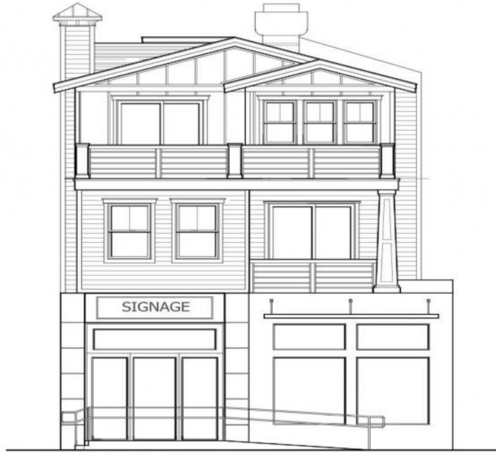
ASBURY AVENUE ELEVATION