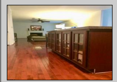
36 Shoreline Egg Harbor Township, NJ 08234