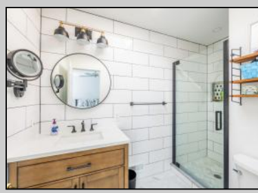
133 Wesley Ave Ocean City, NJ 08226