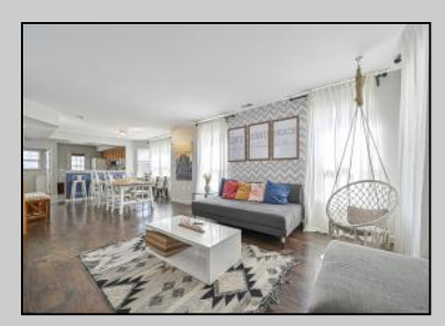
115 Houston Ave Atlantic City, NJ 08401