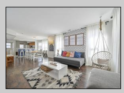
115 Houston Ave Atlantic City, NJ 08401