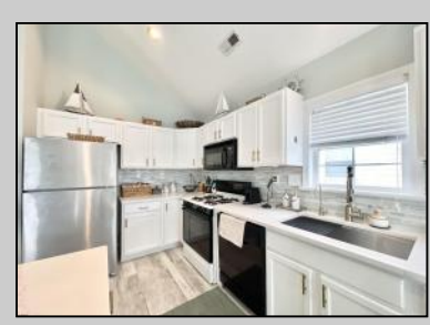
1447 Haven Ocean City, NJ 08226