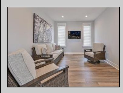
121 5th St S Brigantine, NJ 08203