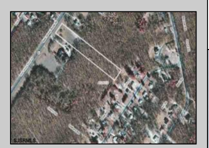
765 Route 54 Williamstown, NJ 08094