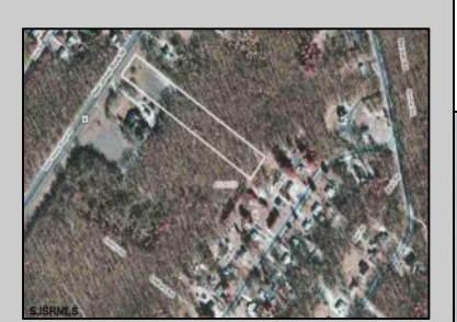
765 Route 54 Williamstown, NJ 08094