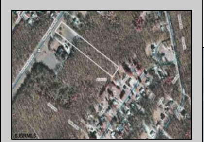
765 Route 54 Williamstown, NJ 08094