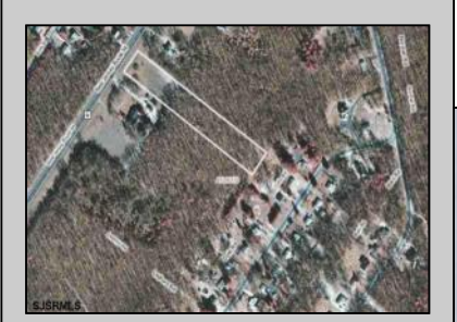
765 Route 54 Williamstown, NJ 08094