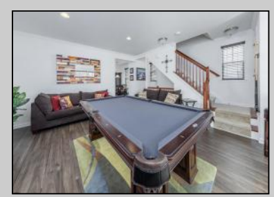
316 Sanderling Ln Pleasantville, NJ 08232