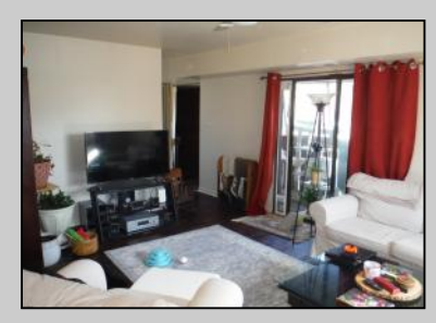
2418 Bayberry Mays Landing, NJ 08330