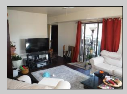
2418 Bayberry Mays Landing, NJ 08330