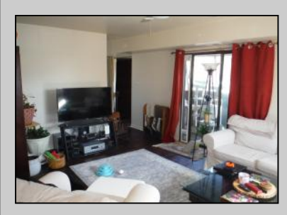
2418 Bayberry Mays Landing, NJ 08330