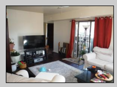
2418 Bayberry Mays Landing, NJ 08330