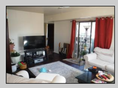
2418 Bayberry Mays Landing, NJ 08330