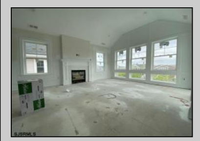
3501 West Ocean City, NJ 08226