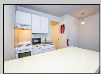
4400 Brigantine Brigantine, NJ 08203