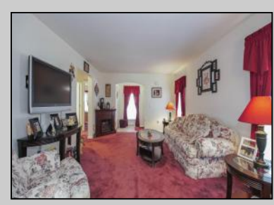
37 Fernwood Mays Landing, NJ 08330