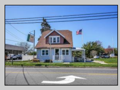
44 Route 9 Marmora, NJ 08223