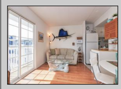
510 3rd Ave North Wildwood, NJ 08260