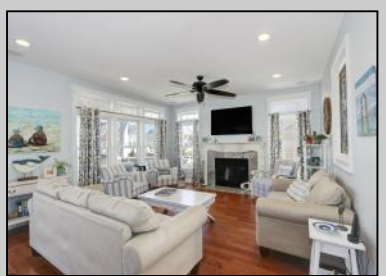
312 31 Brigantine, NJ 08203