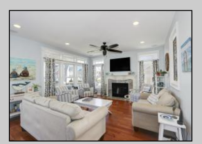
312 31 Brigantine, NJ 08203