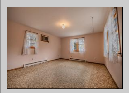
4557 Pleasant Mills Hammonton, NJ 08037