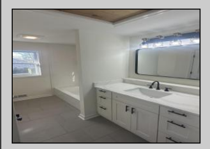
106 Haddon Rd Somers Point, NJ 08244