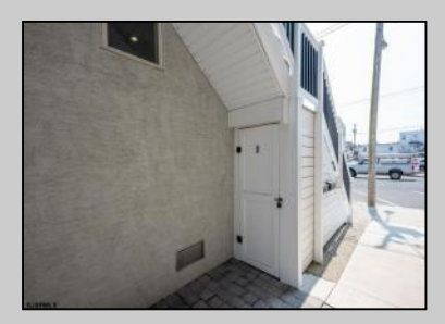
708 West Ave Ocean City, NJ 08226