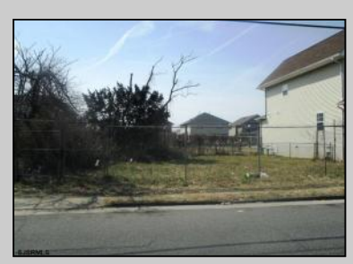
110 New Jersey Atlantic City, NJ 08401