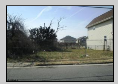
110 New Jersey Atlantic City, NJ 08401