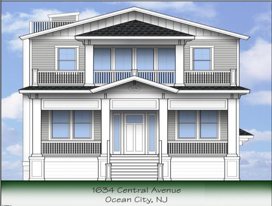
1634 Central Avenue Ocean City, NJ