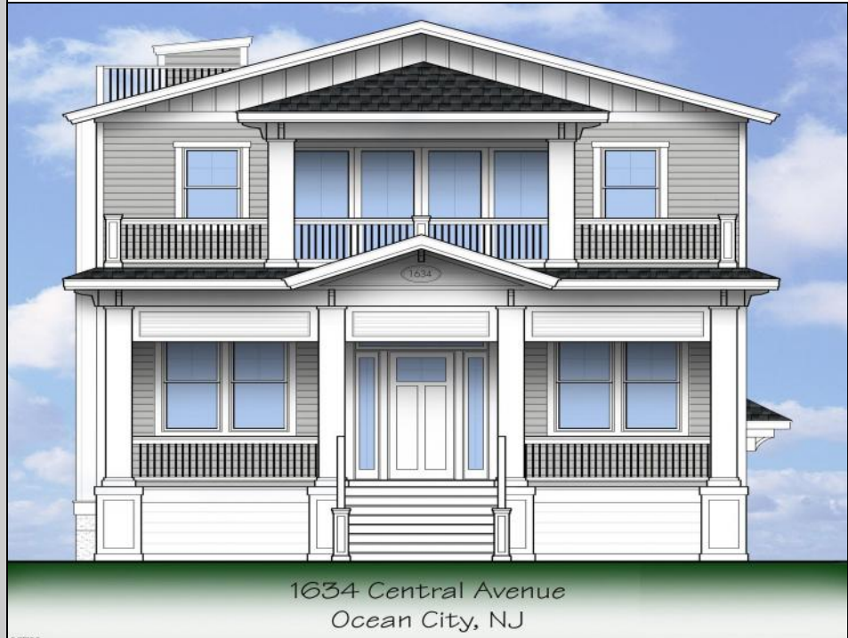
1634 Central Avenue Ocean City, NJ