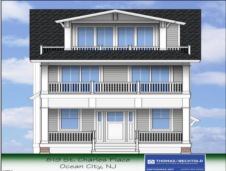
819 St. Charles Place Ocean City, NJ

THOMAS/BECHTOLD ARCHITECTURE & ENGINEERING GWTOMAS.NET (609) 927-5050